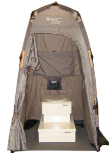
Pacto® is often installed in tents in camps and mines, creating fully functional, hygienic 'bathrooms'