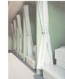
Pacto® in a shelter for field operations