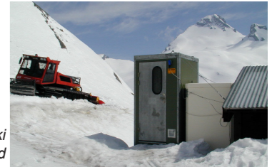
Pacto® in a cabin in a ski resort in Switzerland