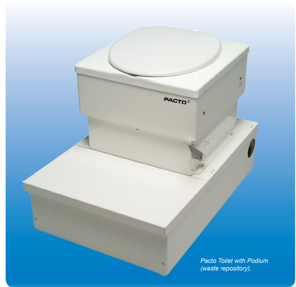
Pacto Toilet with Podium (waste repository).

Should you experience any problems with the toilet, we offer a 5-year warranty on all materials.